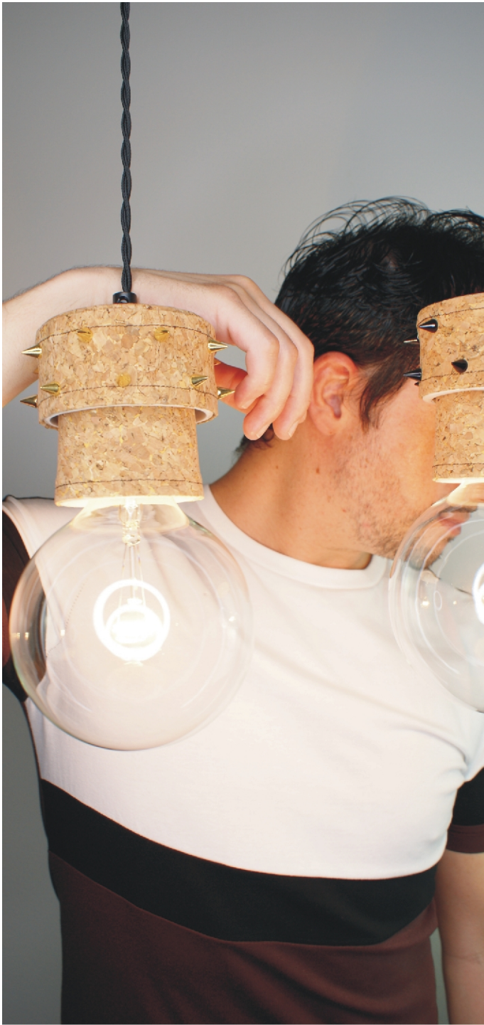
CORKSTAR, design by Rodrigo Vairinhos