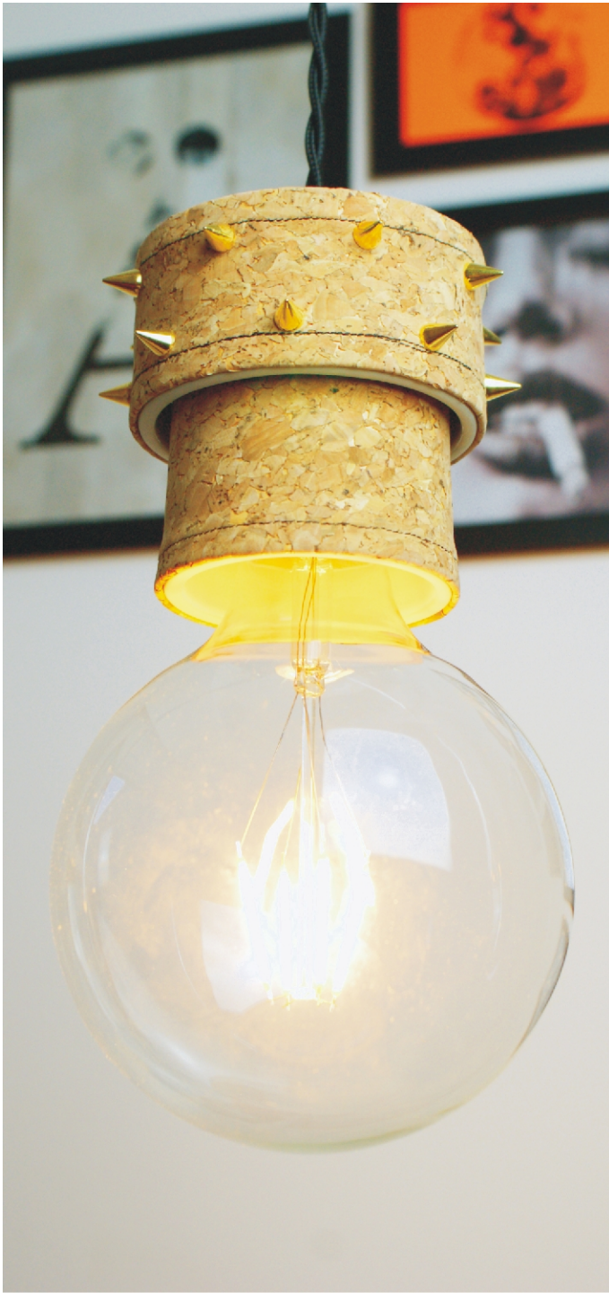
CORKSTAR gold , design by Rodrigo Vairinhos