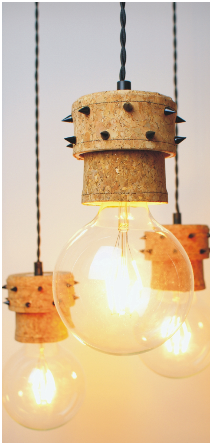
CORKSTAR black , design by Rodrigo Vairinhos