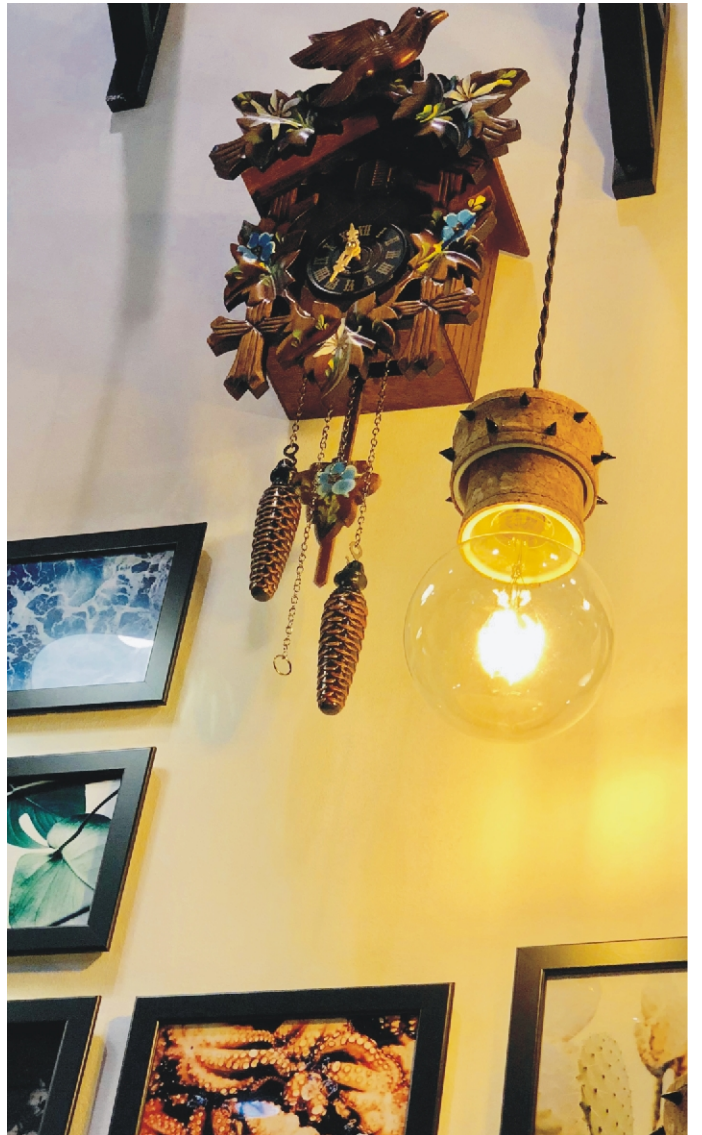
CORKSTAR suspension lamp 3