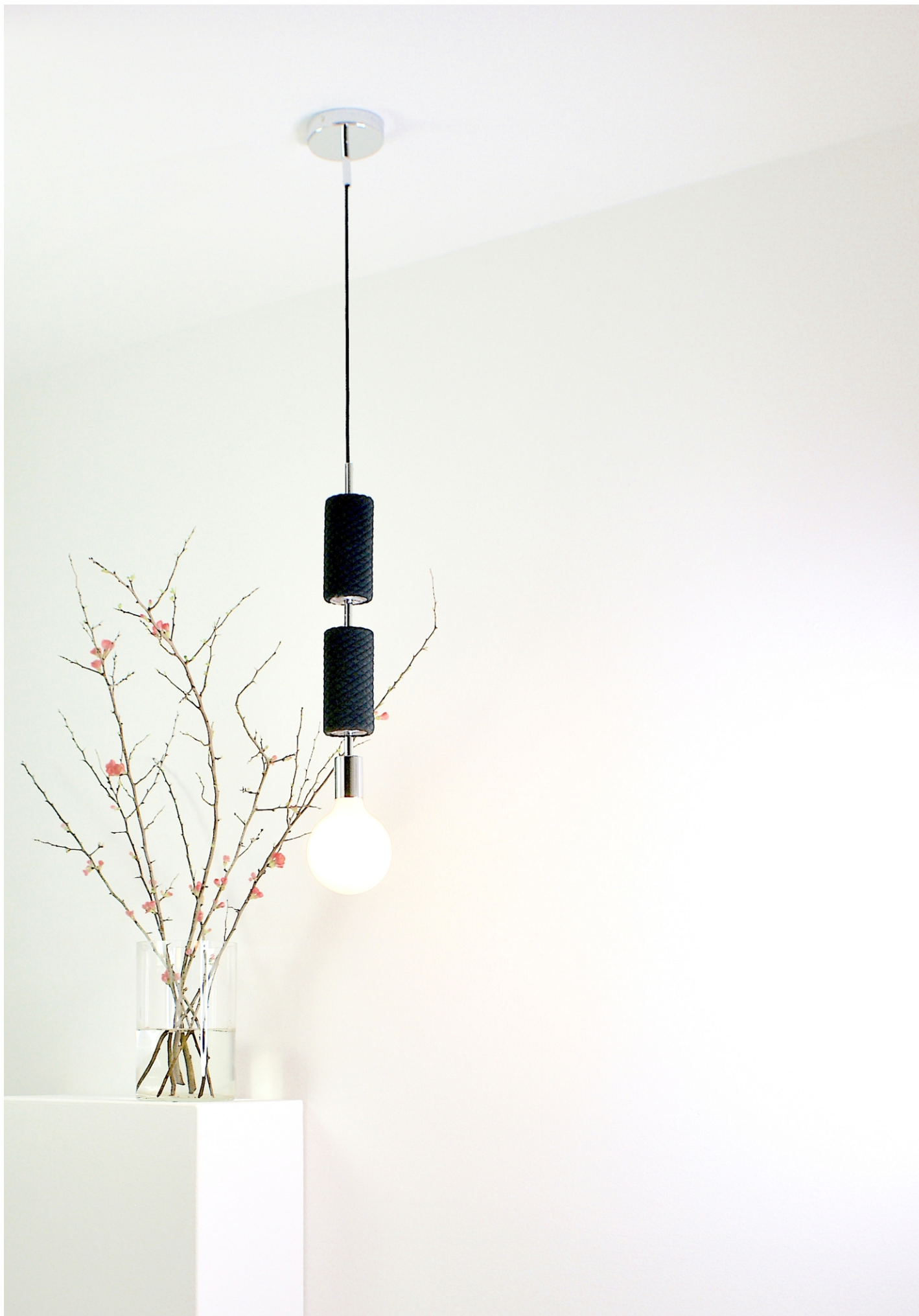
SLICES suspension lamp 4