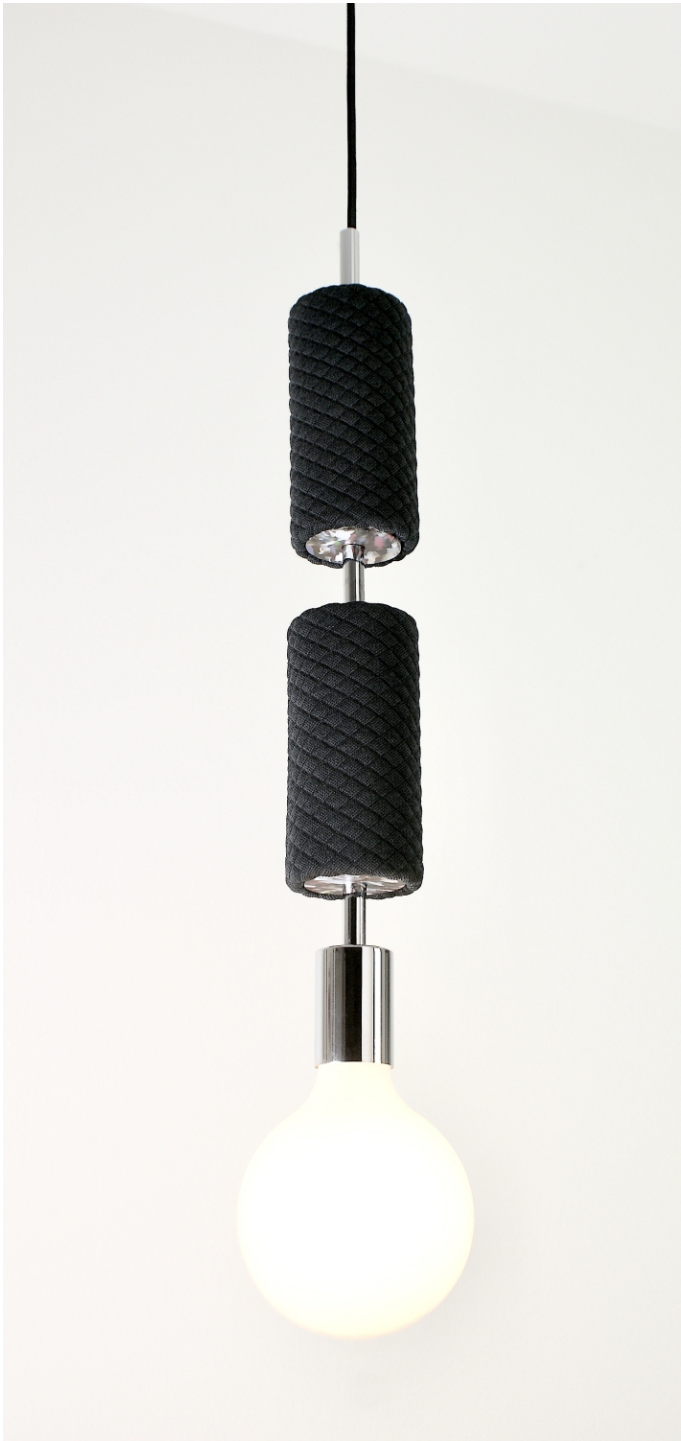
SLICES , design by Rodrigo Vairinhos