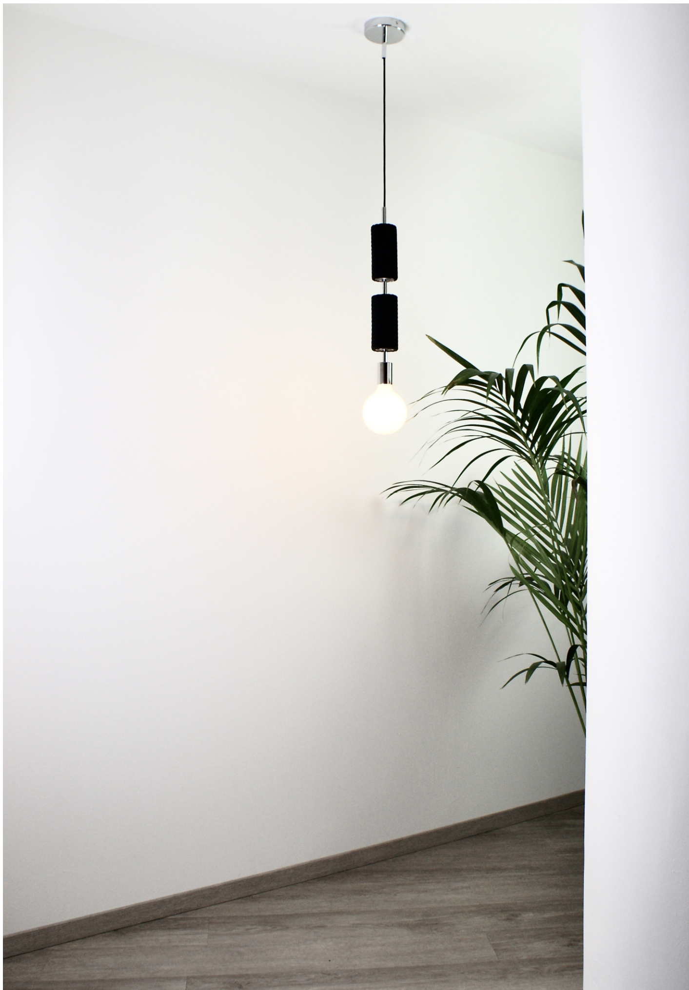
SLICES suspension lamp 3