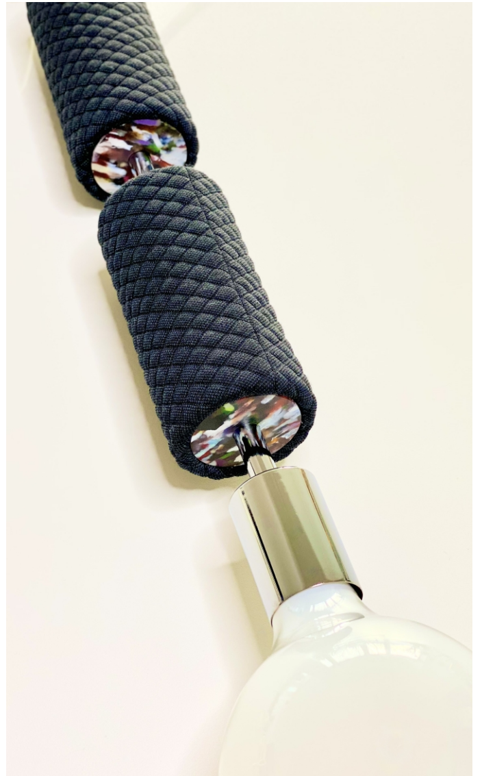
SLICES suspension lamp 2