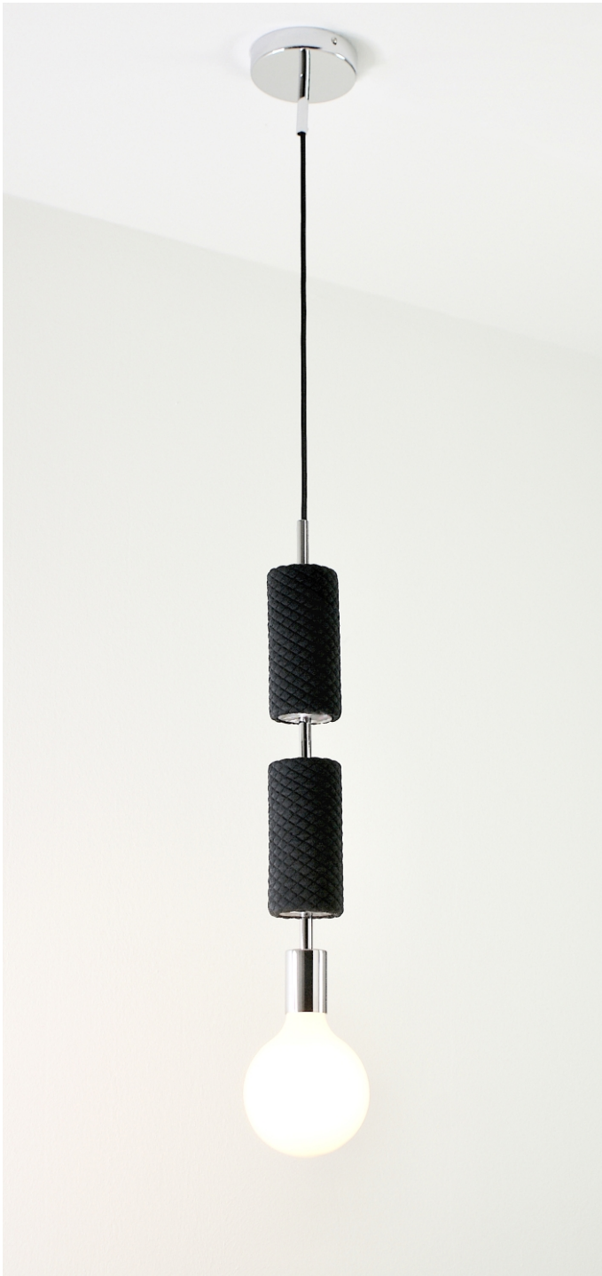
SLICES , design by Rodrigo Vairinhos

SLICES is a beautiful vertical suspension lighting fixture of minimal design composition executed in a mix of contrasting materials and colours, such as chrome plated metal, tridimensional fabric and lively coloured 100% recycled PET plastic.