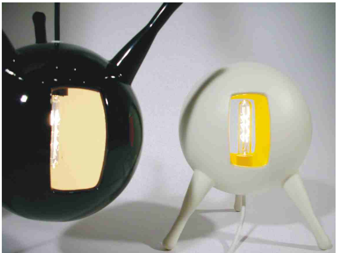
Space Invader , 2007, designed by Rodrigo Vairinhos